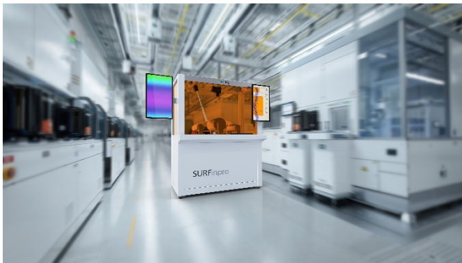
Fig. 1 Thanks to a sophisticated modularization approach using efficient components, SURFinpro has a wide variety of potential deployments and is easy to adapt.